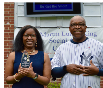
Citadel of Faith Christian Fellowship Thomasville, NC

Citadel of Faith Christian Fellowship, Inc.