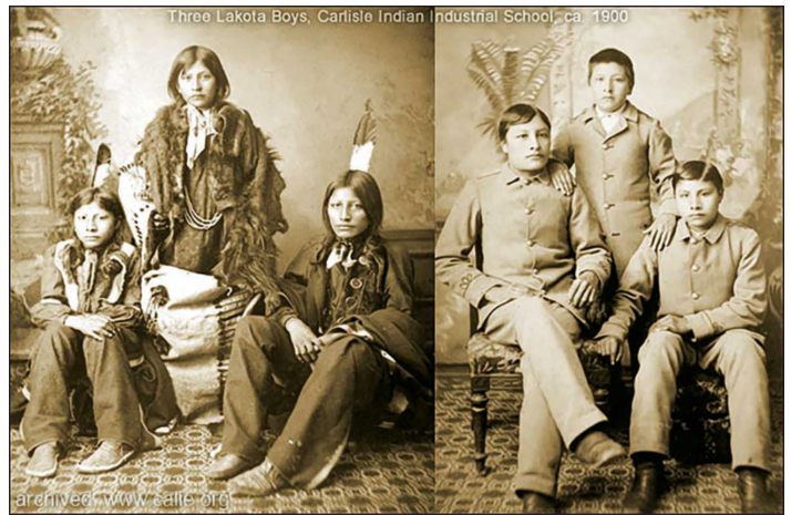
Three Lakota Boys, Carlisle Indian Industrial School, circa 1900