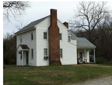
The Allen Jay House

At our February monthly meeting for business, Springfield approved asking for help with replacing the furnace at the Allen Jay house. We have estimates from three local HVAC contractors for replacing the old furnace. The range is from of $6,000 to $7,000.