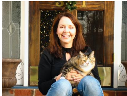
Patches, My Quaker Kitty